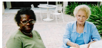
Below: Participants enjoy lunch on the patio of the Live Oak Pavilion at Florida Atlantic University.