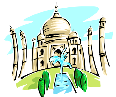
Palm Beach County has three mosques: Boca Raton, Lake Worth and Belle Glade