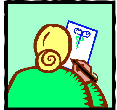
Faith-based nurses assist individuals so that they do not "fall through the cracks" of our healthcare system.

Seize the Opportunity! Volunteer are needed to assist with the phone surveys! To respond: Ph: 561.379.1972 Email: IHWAssoc@aol.com